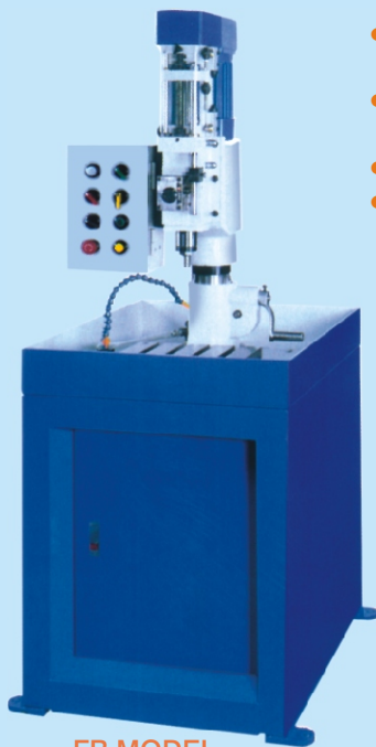
FB MODEL HYDRAULIC DRILLING MACHINE